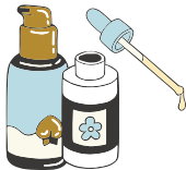
SÉRUM ANTI- ACCIDENT